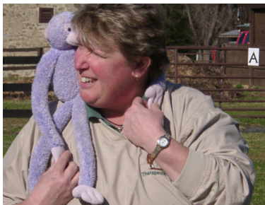
As the Executive Director as well as an Instructor, there is always something to monkey around with!