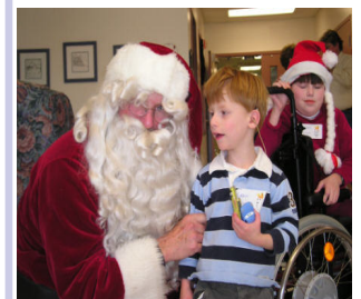
Santa, doing his magic!