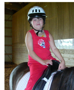
Our riders, horses and volunteers come in all shapes and sizes!

The students I've volunteered with have taught me so much about life, about the precious parts that are often taken for granted. I am thrilled to witness horses giving students legs to walk on and wings to fly!